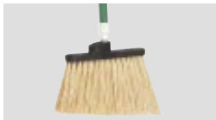
41083 - Duo-Sweep® Angle Broom is designed for extended use and superior performance