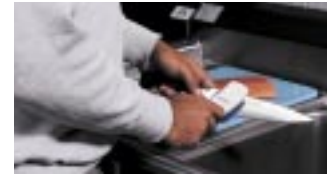
41395 - Knife Cleaning Brush cleans knives safely and efficiently