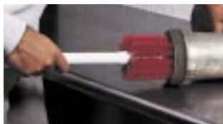
The Meat Kit General Clean-Up Tools include 40007 - Meat Grinder Brush