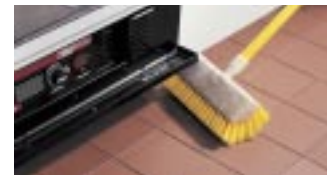
40423 - Hi-Lo™ Floor Scrub provides maximum cleaning at 3 different angles