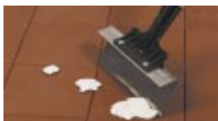
The Bakery Kit Floor & Drain Care includes a 41619 - Floor Scraper