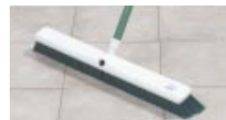
The Produce Floor & Drain Care includes 41890 - 18" Sparta® Spectrum® Omni Sweep™

Sparta® Spectrum® Kits include two Wall Charts, a General Clean-Up Tools Wall Chart, and a Floor & Drain Care Wall Chart. These laminated charts provide a visual reference for your employees on proper brush storage, brush maintenance, brush reorder, and information on preventing cross-contamination.