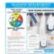
General Clean-Up and Floor & Drain Care Wall Charts are included in each kit