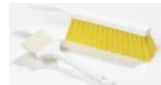
The Bakery Kit General Clean-Up Tools include 40480 - Spectrum® Floor Bench Brush and 40379 - Sparta® Meteor® Pastry/Basting Brush