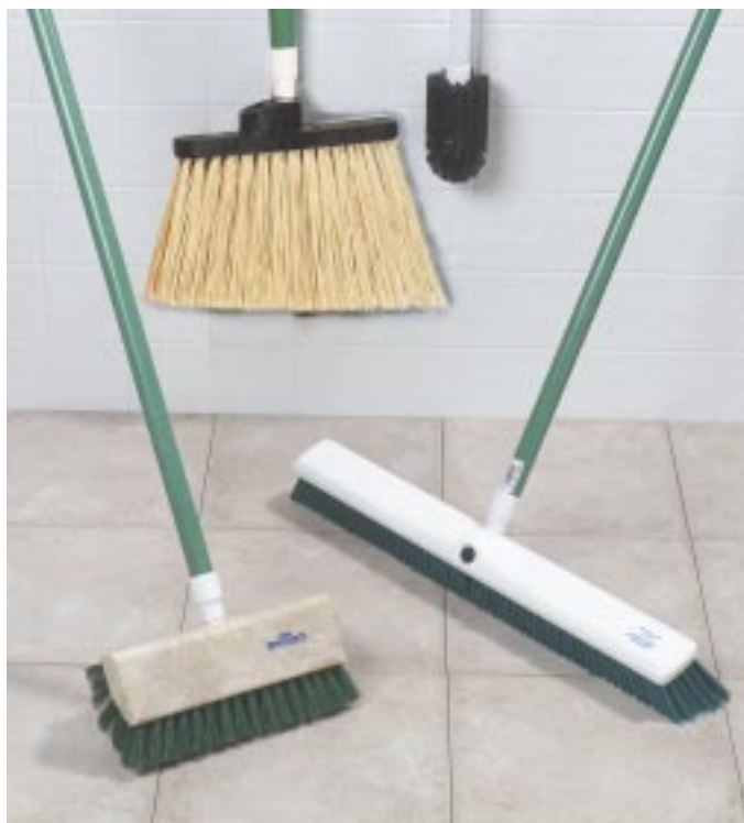
Produce Floor & Drain Care products include 18" Sparta® Spectrum® Omni Sweep™, 3" Floor Drain Brush, a Sparta® Spectrum® Angle Broom, Sparta® Spectrum® Hi-Lo™ Floor Scrub Brush, and Wall Chart