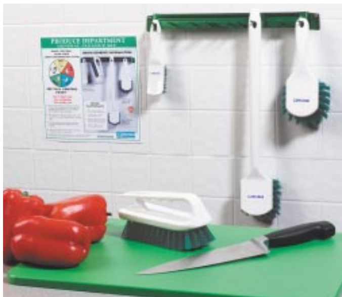
Produce General Clean-Up Tools include Sparta® Spectrum® Knife Cleaning Brush, Iron Style Hand Brush, 8" and 20" All Purpose Utility Scrub Brushes, Brush Rack, and Wall Chart

Carlisle's Sparta® Spectrum® Kits are specifically designed to help meet HACCP guidelines for food safety. These five color-coded brush kits help ensure sanitary maintenance of equipment and designated work areas by aiding in the prevention of hazardous cross-contamination. The five Spectrum colors of the kits include: Blue for Seafood, Green for Produce, Red for Meat, White for Deli, and Yellow for Bakery.