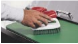
40024 - Iron Style Hand Scrub reaches into tight crevices and corners