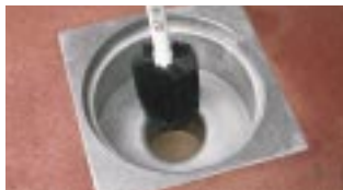
Floor Drain Brush, 40146 with 36" long plastic handle, 40236; keeps drains and floor sinks clean and sanitary